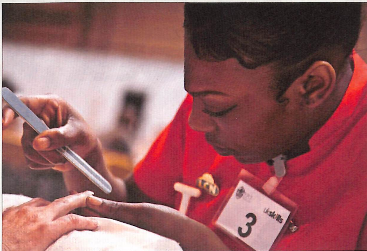
WorldSkills UK Nail Technology competitor at Beauty UK, NEC Birmingham

final for Graphic Design and Web Design, were held at Middleton Hall in The Centre:MK on 2 and 3 July.