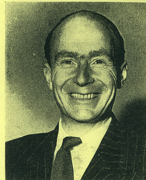
DR. P. J. HILLERY, Minister for Education.

By mhait liom go speisialta, i dteannta na fáilte, focal molta agus gríosaithe a rá leis na hiomathóirí. Onóir nach beag é do dhuine óg go dtoghfaí é le clú a thíre a chosaint sna comórtais seo. Ní bheidh bonn óir, nó airgid nó cré-umha ach ag cuid agaibh nuair a bheidh tortha na gcomórtas foilsithe. Ach tá le fáil ag gach éinne agaibh duais is luachmhaire ná bonn. Beidh sibh, ar feadh na tréimhse a bheidh sibh anseo, in bhur gcomhnaí le chéile i spiorad an charadais agus an chomhbráithreachais. Beidh deis agaibh aithne a chur ar bhur gcomhpháirtithe óna tíortha eile, snadhmanna caradais a cheangal, eolas a chur ar chúrsaí saothair agus sóisialta i dtíortha a bhfuil báidh ag bhur dtíortha féin leo. Má bhaineann sibh an tairbhe is fearr is féidir a bhaint as an deis sin, beidh toradh an-fhónta ar an Dara Comórtas Déag seo in Eirinn.