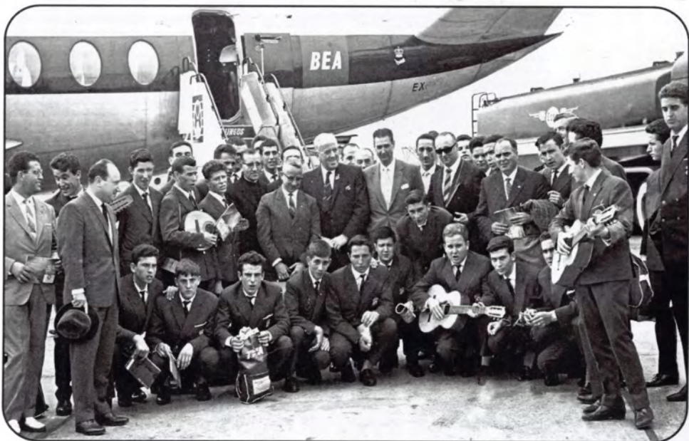
The Spanish Team members entering into the Irish Spirit on the Tarmac at Dublin Airport in 1963