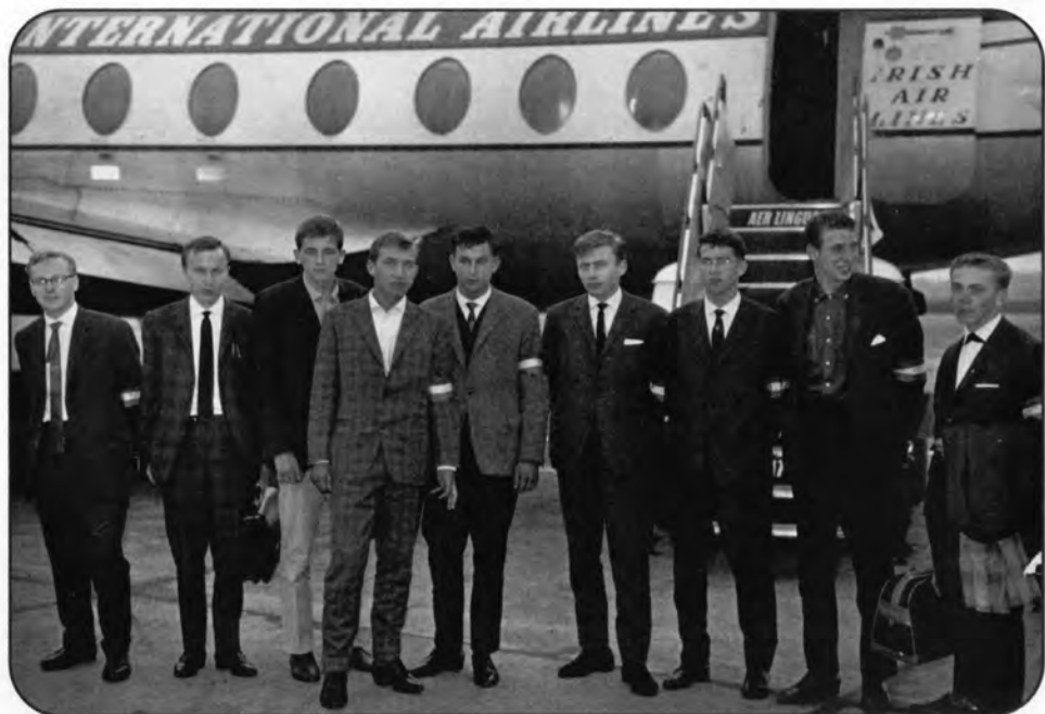
The Austrian Team members pictured on the Tarmac at Dublin Airport in 1963