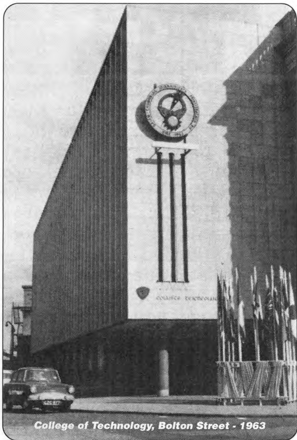
College of Technology, Bolton Street - 1963