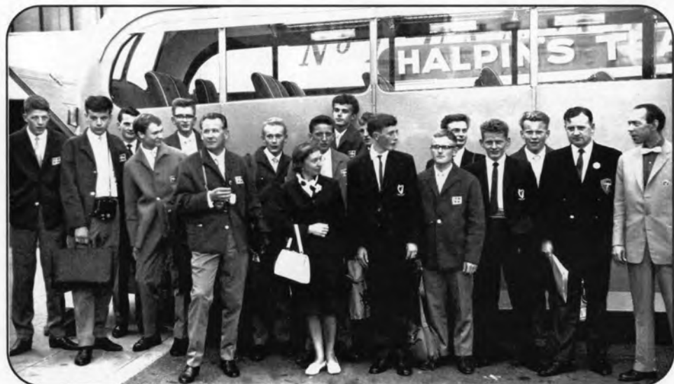
Competitors and officials on a day trip following the competition