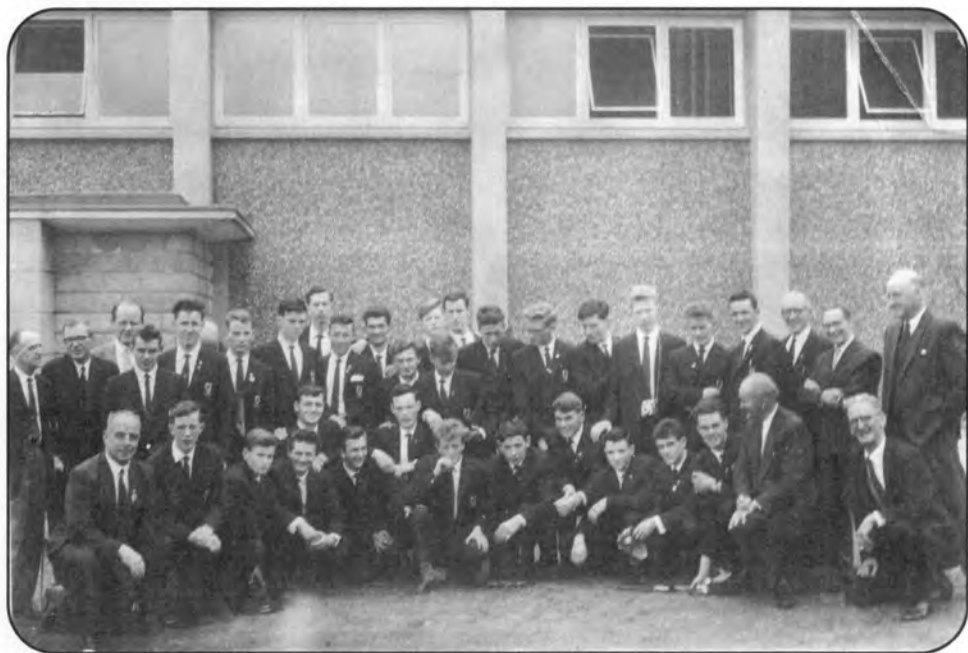
Members of the Irish team who competed in the 1963 competition pictured with officials at Gormanston College