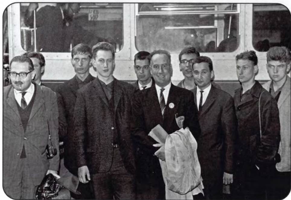
Officials and Competitors pictured on their arrival in Dublin in 1963