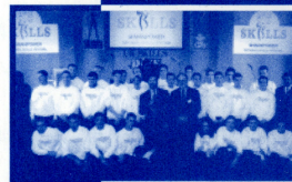
WorldSkills 2001 Team members