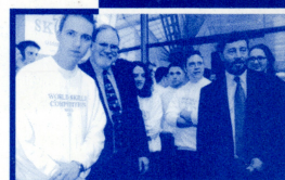
Celebrating Skills at the Dome