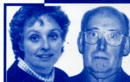
Welcome to other new staff