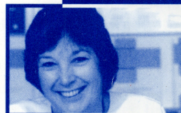
Our new Chief Executive