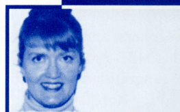
National Training Awards